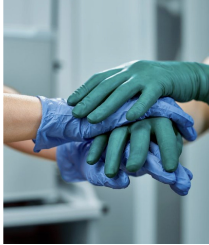
Figure 3: Medical teams need to work together