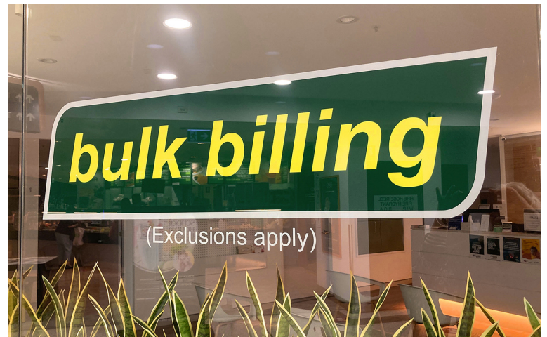
Figure 5: Main issue relates behind bulk billing