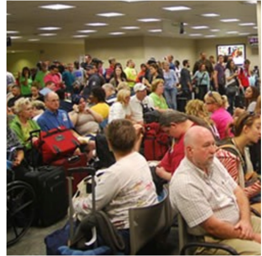
Figure 4: Waiting room in an overcrowded hospital