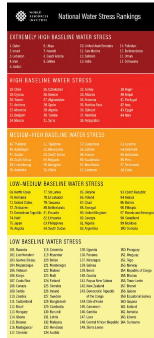
Water Stress Rankings by Country from the World Resources Institute.