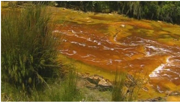
Pollution in the King River, Tasmania.