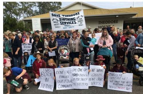
The town of Theodore in Queensland rallied to bring back their maternity service in 2018.