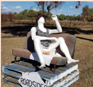
Residents of a Queensland town have been concerned roadside births will increase since their maternity service closed.

"...newborn death rates in rural hospitals or clinics without birthing units were about three times higher than those with the units."