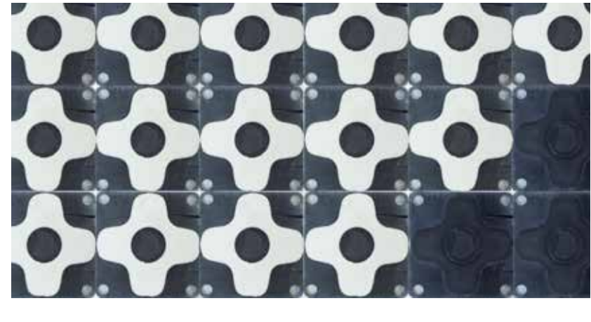
1:1 Scale models of the Metaphor patch and scanner being apploed, activated and waiting to be replenished.