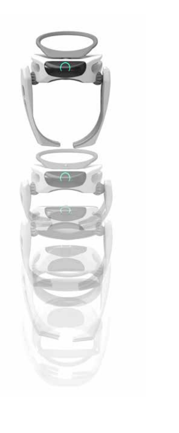
Metaphora in use in a local hospital, nutrionalising patients through appendaegal route

The Metaflora provides patients, medical staff and hospital visitors with a more relaxed environment due to the innate calming properties of greenery within indoor spaces. The farms themselves are natural air filters and air coolers, providing the indoor space with clean air and comfortable temperatures for those inhabiting it. Fresh and organic produce is delivered straight to the patients, staff and visitors, which are also higher in nutrition due to the hydroponics farming system. When all hospitals have adopted this system, the community benefits from the Metaflora marketplace. The Metaflora marketplace is a way in which hospitals can trade their supplies - such as biomethane cylinders, fresh produce, compost and liquid fertiliser - with each other, exchanging their excess of one thing for something else they may be low in. What is created is a sustainable community that not only benefits those who reside within each building, but benefits all by facilitating a supportive environment.