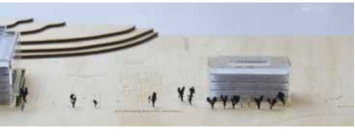
1:1000 Scale Model of Alfred Hospital, exploring retro fitting in existing architecture.